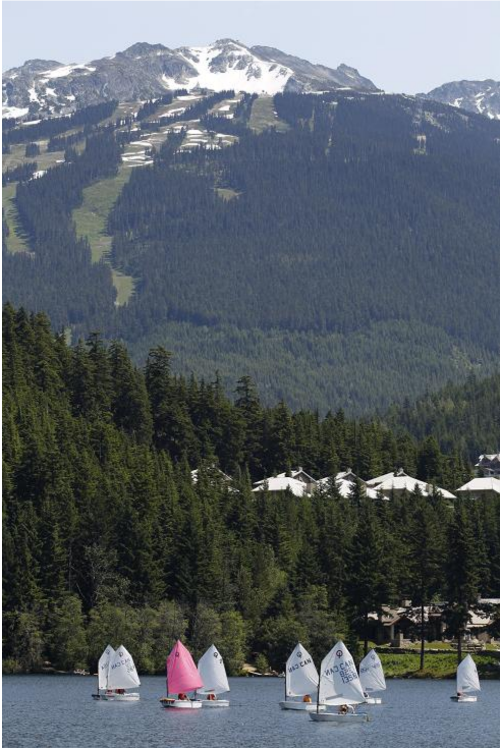
Our fleet of Optimist Sailboats sailing on Alta Lake, Whistler, BC.