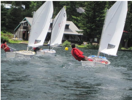
Whistler Sailing students sailing “Optimists” by the club house

Discover Sailing for Grades 3 to 7 is taught with “Optimist” dinghies. The Optimist is used world-wide for instruction and as an international racing class.